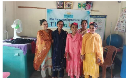
The 3 girls that need extra care