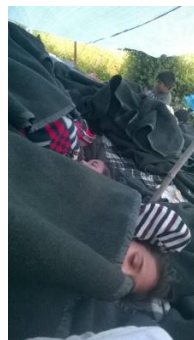
2015 after the earthquake in Nepal