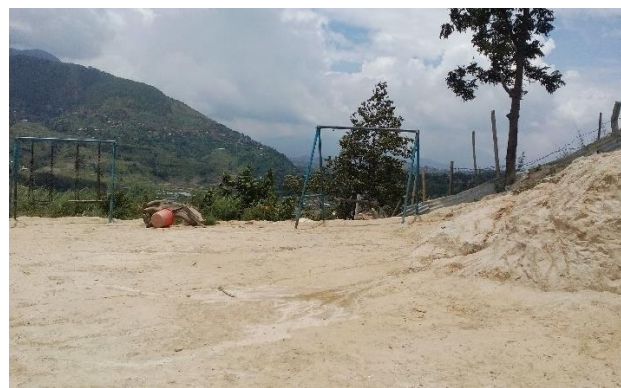
Space for the Activity hall